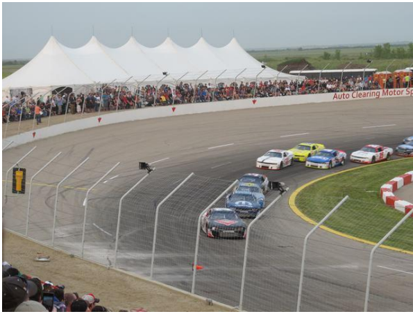
This picture shows VIP EAST